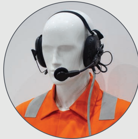
Operator headset – neck band, boom mic