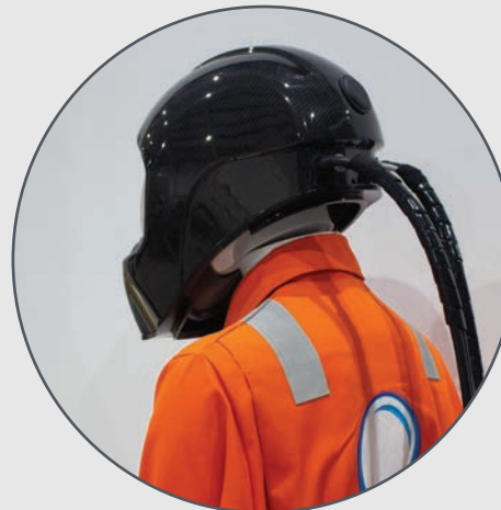
Hornet/Firefly helmet headset