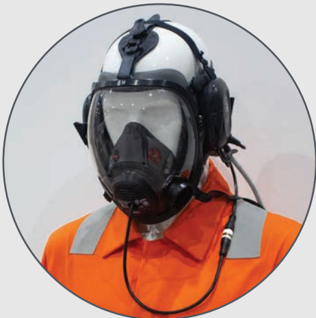
Vision/neckband muff headset (m12 connectors)