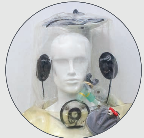
Air suit headset with stud pads