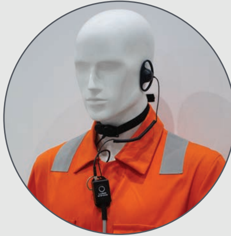
Throat/mask harness mic and D-speaker headset