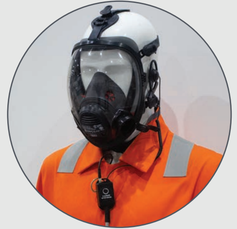
Vision/Throat/mask harness mic and